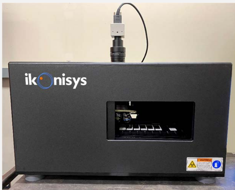
FIGURE 2: THE ICONISCOPE20

The entire scanning process is efficiently controlled by hardware and imaging algorithms. This allows slides to be scanned quickly while producing high quality, optimally focused and exposed images of cells that appear malignant. This automation of workflow significantly reduces dependence on the subjective skills of laboratory staff.