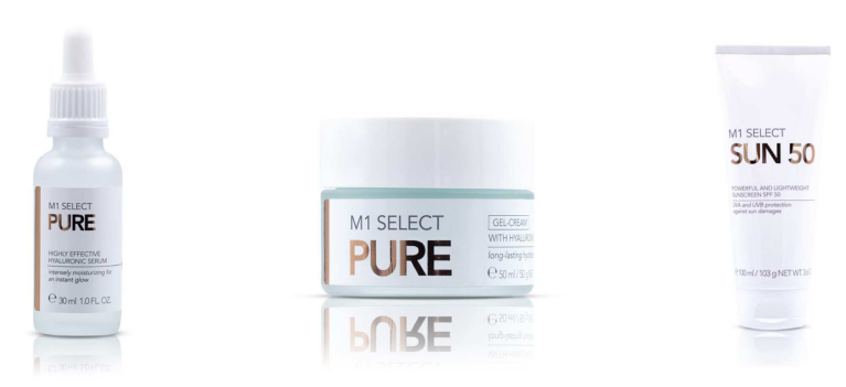
Figure 3: Overview of M1-Select's new antioxidant serum (left), moisturing cream based on hyaluronic acid (middle) and sun protection cream (right)